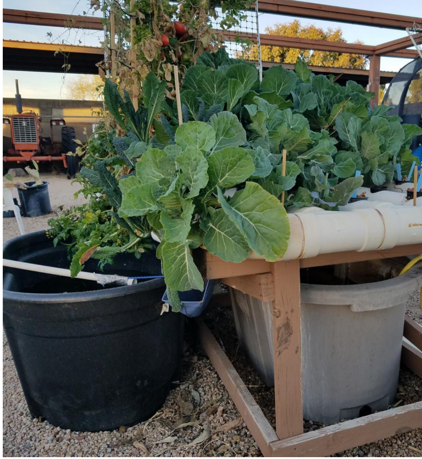
In aquaponics gardening, plants grow without needing soil.

And now we take a look into something fishy. Freshwater prawns are raised right here in the desert, believe it or not.